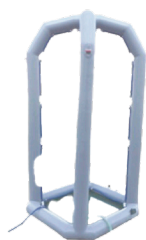
Inflatable Washing/ Disinfection Sprinkler