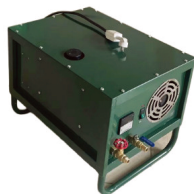
New Lightweight Heater