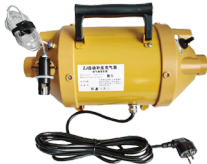
Electric Inflator/Deflator Pump 1800W