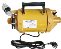
1900W Electric Inflation/Deflation Pump