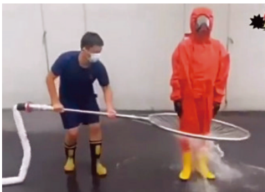
Annular Washing/Disinfection Sprinkler