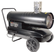
Warm Air Generator