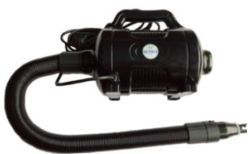
600W Electric Inflation/Deflation Pump