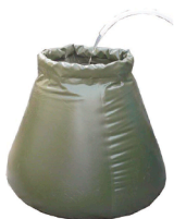
Self-lifting Water Storage Bag