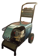
Mobile High-Pressure Washing/Disinfection Pump