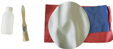
Repair Kit ( repair fabric, glue, glue brush)