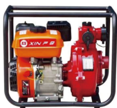
Siphon/Pumping Washing/ Disinfection Water Supply Pump