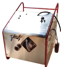
Washing/Disinfection Water Heating and Pressurization Integrated Unit