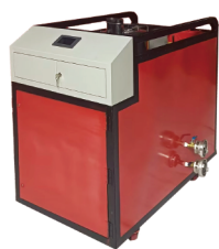
Touch Smart Control Washing/ Disinfection Integrated Unit