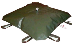
Washing/Disinfection Contaminant Collection Bag