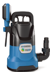
Washing/Disinfection Sewage Discharge Pump