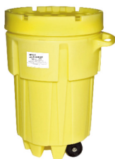
Toxic Material Sealed Drum/Barrel