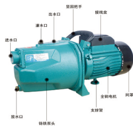
Electric Water Supply Pump